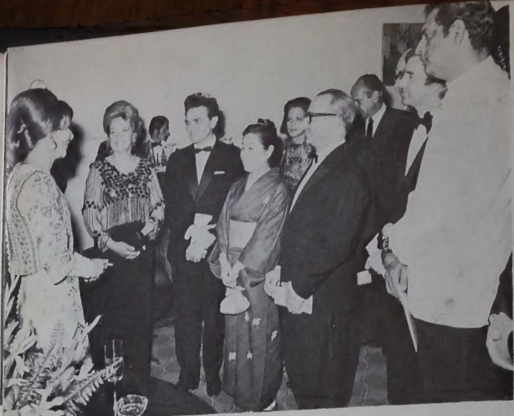
● علیاحضرت شهبانو اعضا، هیئت داوران جهانی نخستین جشنواره جهانی فیلم تهران را مورد عنایت خاص قرار میدهند

مراسم اعلام برندگان جوایز نخستین جشنواره جهانی فیلم برگزار گردید